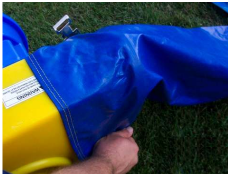
Step #10: Blower Unit

Place an ample amount of the primary blower tube over the blower unit neck.