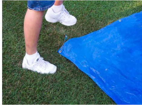
Step #2: Tarp

Lay out the tarp and temporarily secure the corners with stakes or weights.