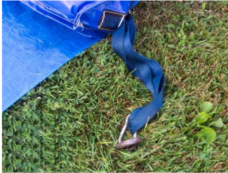
Step #7: Stakes

Drive stakes all the way into the ground.