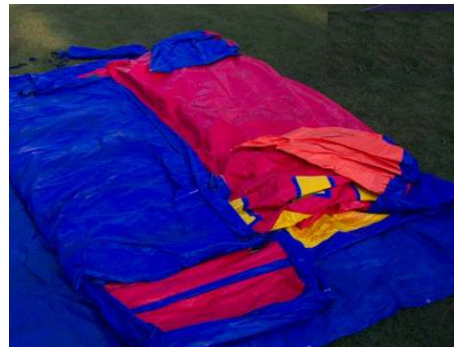
Step #5: Unfold

Unfold the inflatable as flat as possible and continue to check for any damage.