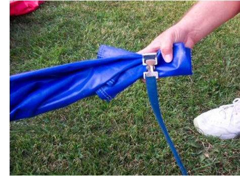
Step #9: Blower Tube (cont...)

Tighten the cinch strap to close the tube. Lay the tube flat and straight.