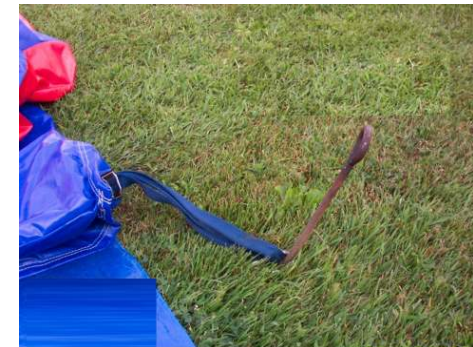
Step #6: Anchor the Unit

Secure each anchor point. Stakes should be angled approximately 15° away from unit.