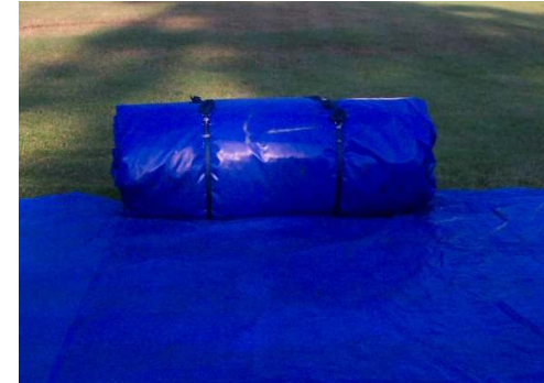
Step #3: Unload

Center unit at back of tarp with the blower tubes facing the rear. Remove the straps.