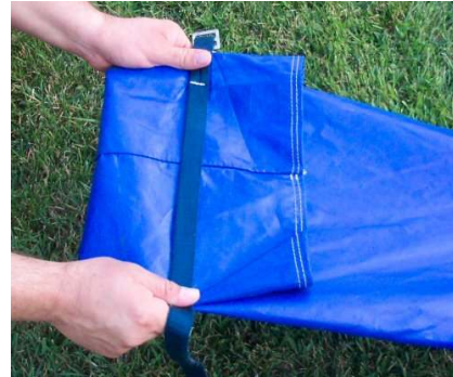
Step #8: Blower Tube

Fold the secondary blower tube on top of itself, and then fold in half.