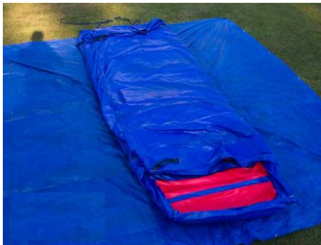
Step #4: Unroll

Slowly unroll the inflatable unit checking for any damage during the process.