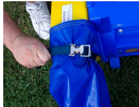
Step #11: Blower Unit (cont...)

Gather excess material from the bottom of the tube and tighten the cinch strap.