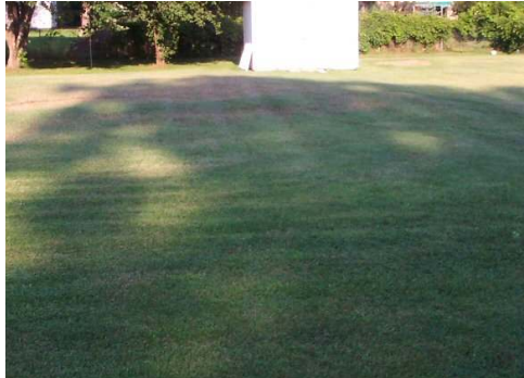
Step #1: Location

Select a level, clear area to place the unit and remove any objects or hazards.